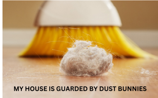
MY HOUSE IS GUARDED BY DUST BUNNIES

During winter, dust and dirt can pile up because we spend a lot of time indoors. Grab a dust cloth, a vacuum cleaner, and chase those dust bunnies away! A good place to look is under beds, behind furniture, and even on top of shelves. If you have a ceiling fan, give it a good wipe too—it's a secret hideout for dust! Vacuuming the vent on your fridge will help extend the life of your appliance and keep your food cooler. This will not only make your place look neat but also help you breathe easier, literally.